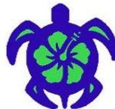
Meet Myrtle the Turtle, the Club's new mascot